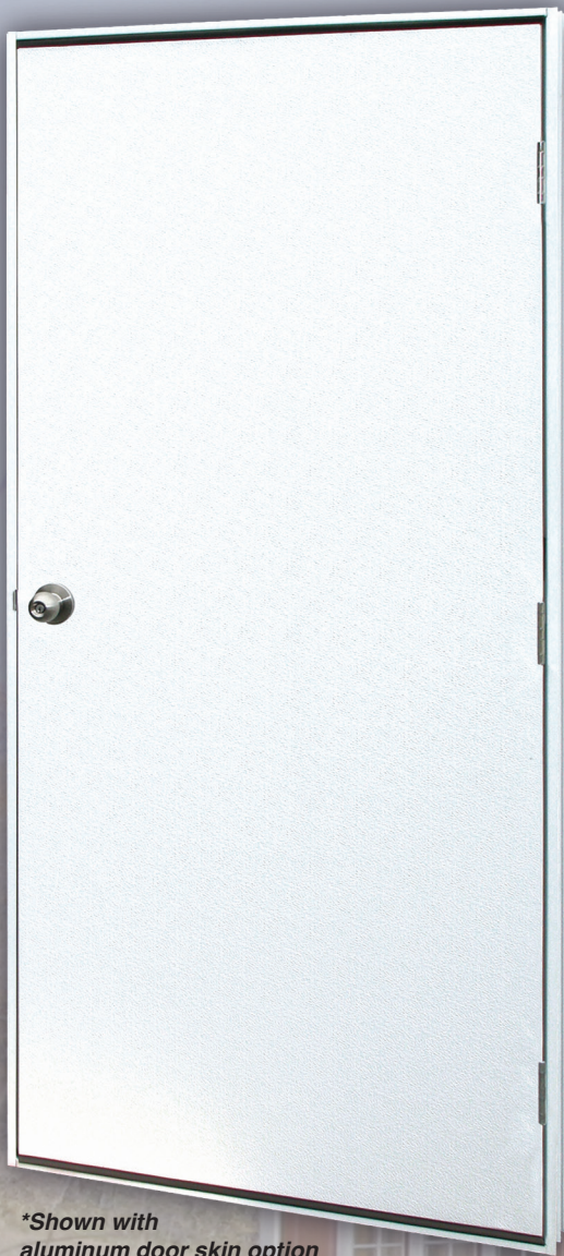
*Shown with aluminum door skin option