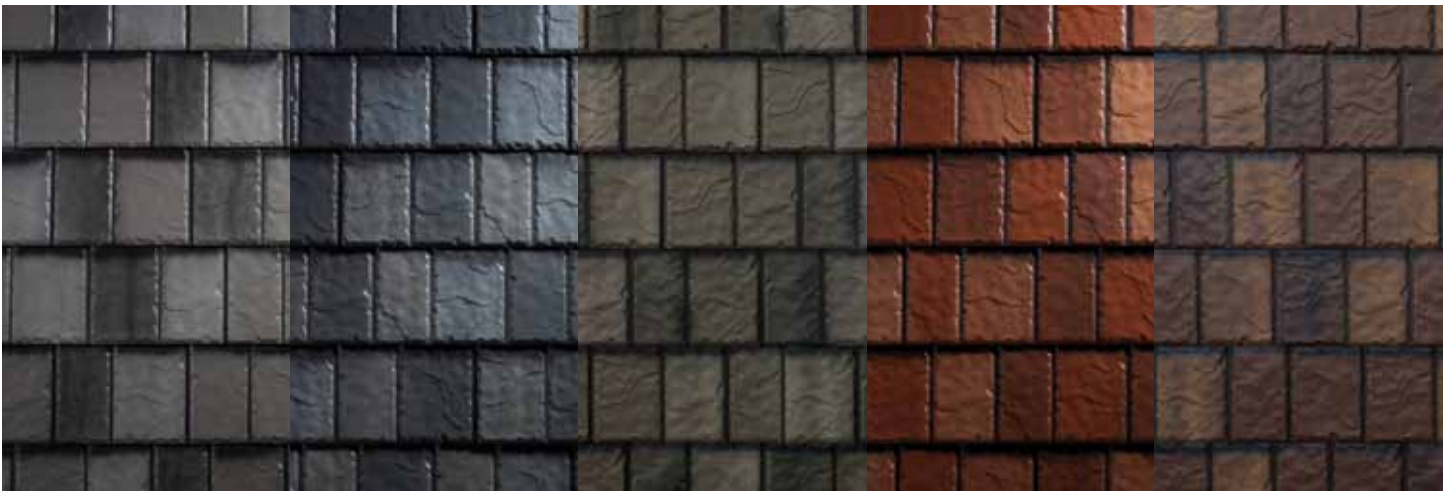
Charcoal Gray Blend*