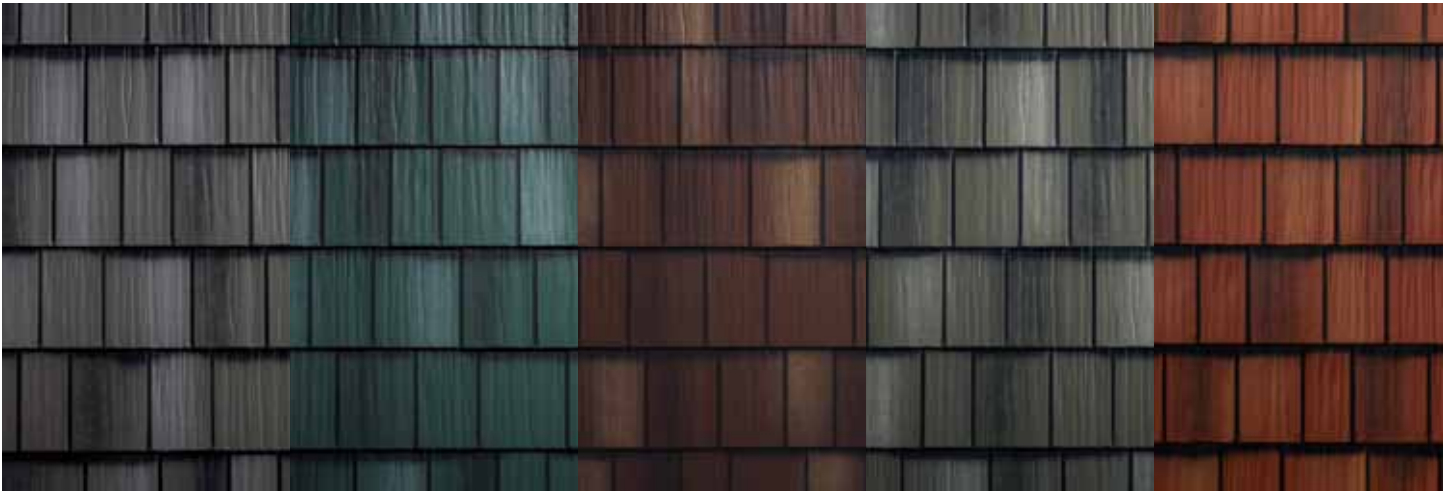
Charcoal Gray Blend*